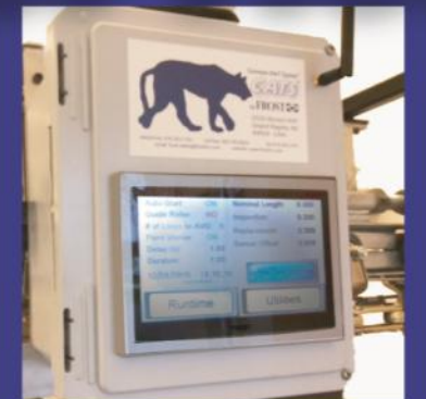
Chain Wear Monitoring from Conveyor to Conveyor

There has never been a cost effective way to predict when that downtime will occur —until now. Frost is proud to introduce The Frost Chain Wear Monitoring System called CATS or Conveyor AlerT System. It integrates digital technology which monitors conveyor chain wear and elongation, alerts you to major chain failures before they occur occur, ready to perform 24 hours a day seven days a week. Ultimately this system saves you routine inspections and unexpected and expensive down time.