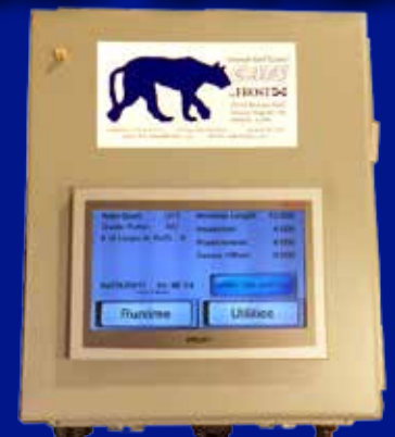
Remote Mounted Display Highly Precise Measurements